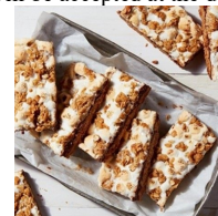
Woodstock Fair Prizes

Reservations for the winning junior exhibitor and one guardian will be made compliments of the Woodstock Agricultural Society, Inc. Additional reservations will be at the exhibitor's expense. No banquet reservations for contest winners will be accepted at the door.